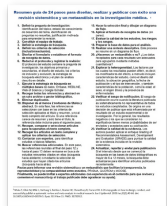
Figure 1: Summary of Muka et al 2019 verification guide.

As such, we have adopted the systematic literature review methodology proposed by Muka[1] which through 24 stages involves different profiles and guarantees a systematic, relevant, multi-focused, directly applicable, and action-oriented collaborative result.